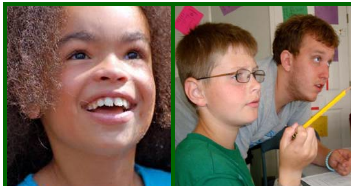
Students at Wediko Programs