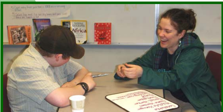
In the classroom at the Wediko School

Wediko Children's Services is celebrating 75 years of serving children, families and schools! We are looking forward to having special events all year to commemorate our history. We will be having a Spring Celebration; for ticket information please call 617-292-9200. Stay tuned for more information on how you can celebrate with us!